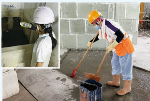
Remove stagnant water and apply larvicides or larvicidal oil at least 3 times a week