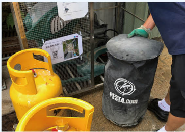
Installation of mosquito trapping devices (MTD) and conduct clearance of catch pans or trapping chamber at least once a week, and continuously review the locations of the MTD and make adjustment if needed