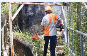
Conduct clearance of weed at least once a week