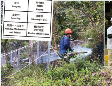
Carry out fogging operation daily

Formulate daily and weekly mosquito control schedule for construction site, conduct inspection and review effectiveness at least 3 times a week by special anti-mosquito team